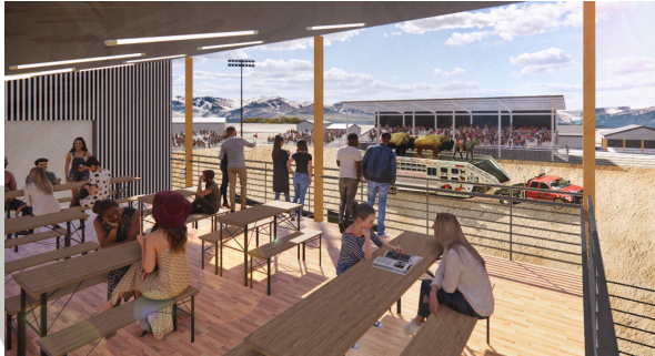
VIEW FROM NEW CROWS NEST SEATING