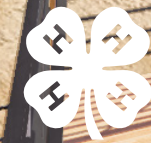
4-H HORSE SHOW