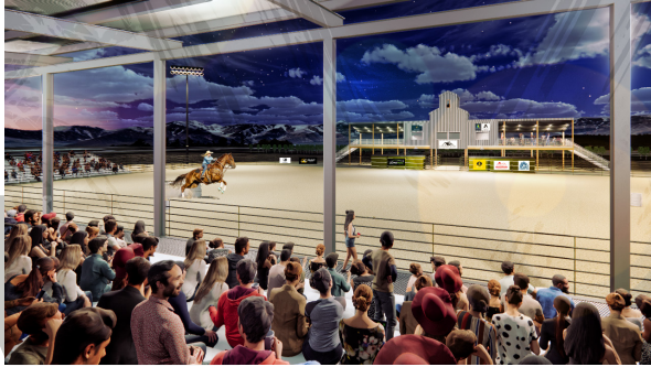
VIEW FROM NEW GRANDSTANDS